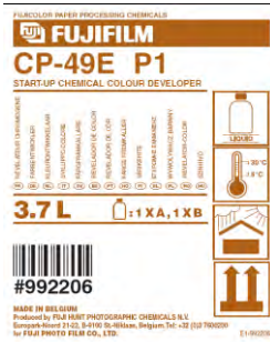
# 992206 FJ CP-49E P1 1x 3.7L