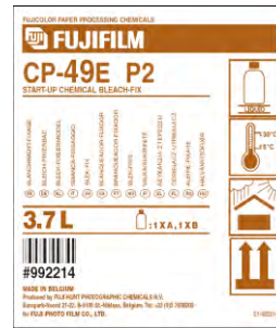
# 992214 FJ CP-49E P2 1x 3.7L